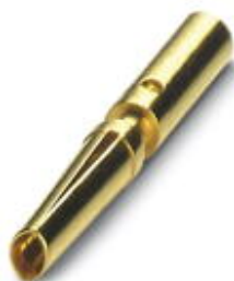
Crimp contact, turned, Contact diameter: 0.8 mm, Crimp range: 0.08 mm²...0.25 mm²

Please be informed that the data shown in this PDF Document is generated from our Online Catalog. Please find the complete data in the user's documentation. Our General Terms of Use for Downloads are valid ( http://phoenixcontact.com/download )